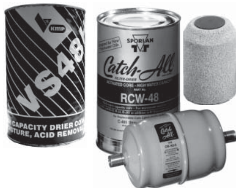
Cores for use with replaceable filter drier shells